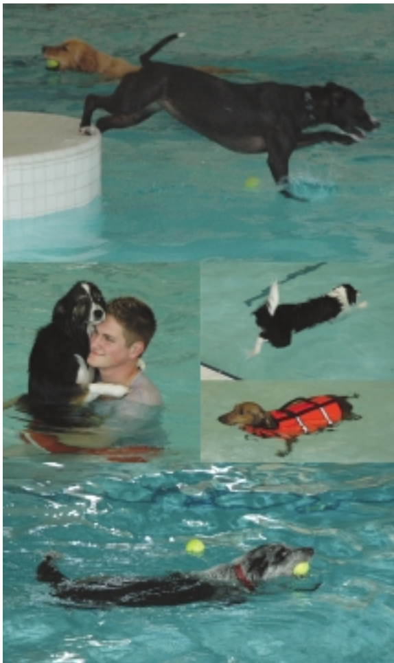
A glance at Dog Swim 2007