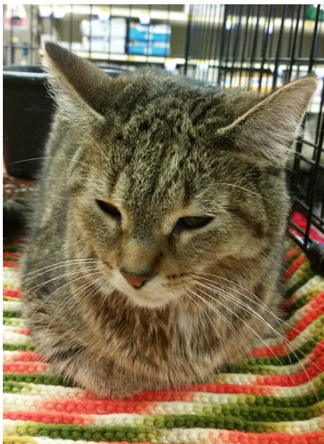
Ginger – asthma

They are either still in treatment or waiting for their forever homes.