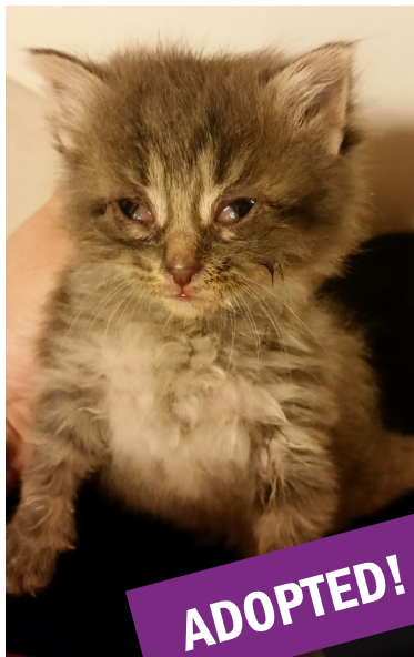
Baby kittens with upper respiratory and eye infections