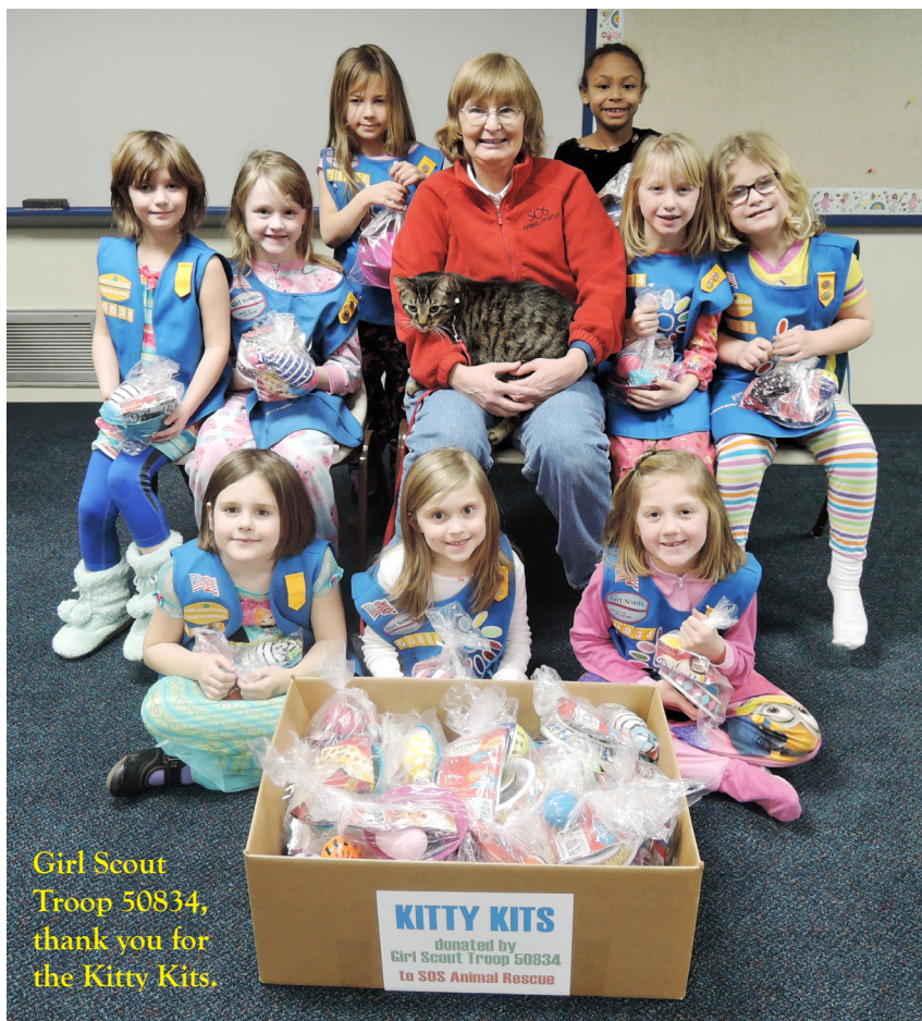
Girl Scout Troop 50834, thank you for the Kitty Kits.