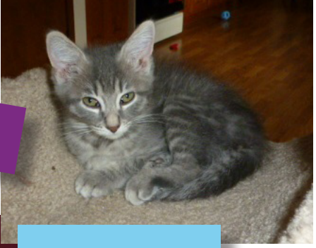
Over the Rainbow Bridge