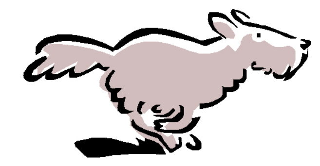
Thank you Midland High cross country team for helping with course set-up.