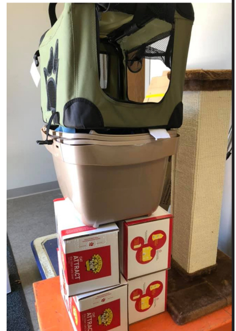
Our first donation to a client at the new Shelterhouse which now has accommodations for pets.