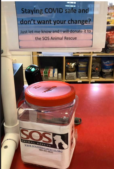
Thank you to Larkin Food Center for a great way to handle change during COVID.